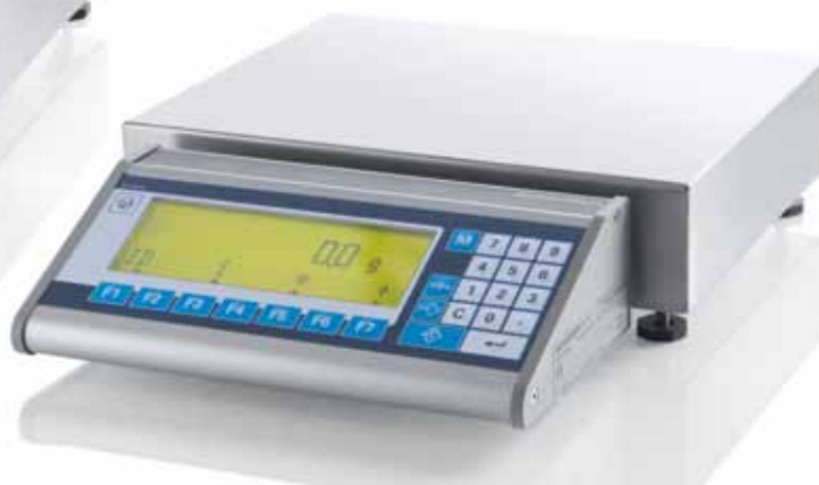
Precision scales EL-3