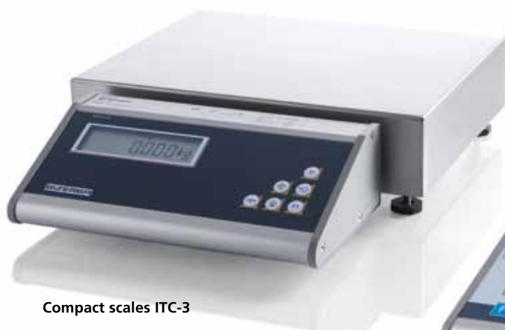
Compact scales ITC-3