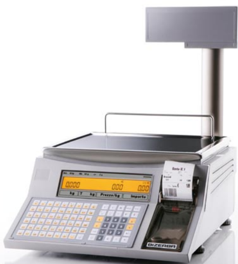
BC II 100 E Electronic top-pan scales with label printer