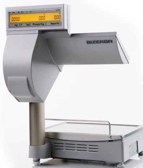
BC II 200 F-E Electronic top-pan scales with customer display on a mounted stand

Multi-use BC II scales offer all the functions and features you expect these days as well as fast and easy operation. Eye contact with customer always guaranteed.