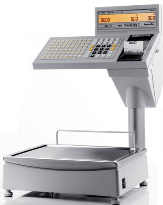
BC II 800 E Electronic retail scales with display, keyboard and printer on a mounted stand

Multi-use BC II scales offer all the functions and features you expect these days as well as fast and easy operation. Eye contact with customer always guaranteed.