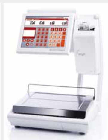
KH 800 2S