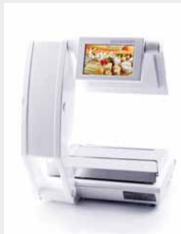
KH 800 Customer perspective