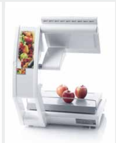
KH 800 SV Customer perspective