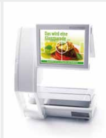
KH 800 2S Customer perspective