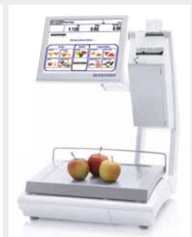
KH 800 SV